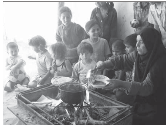
Children watch in anticipation as their grandmother cooks their meal over a wood fire.