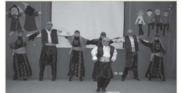
The Atfaluna Debka Troupe in action.

cause for celebration as they debuted at this year's graduation, a joyous occasion in itself.