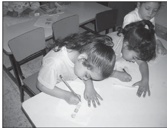
Preschoolers participate in ANERA's drawing contest.

Despite hardships, the schools remained in operation, providing their recreational, social and educational services, until graduation day on May 31 st .