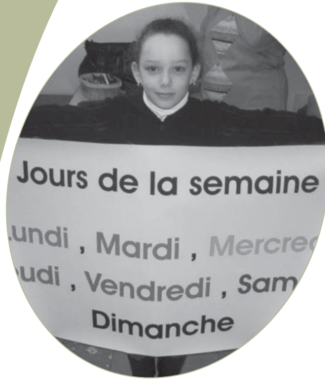
On Rawdat's French Day, a student proudly shows off her banner with days of the week in French.