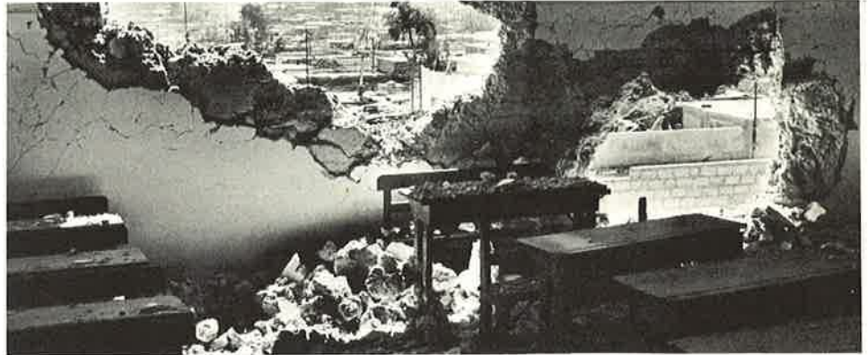
UNRWA's financial situation is aggravated by the necessity of repairing many schools, like this one in New Amman Camp, which were destroyed during the fighting last fall.