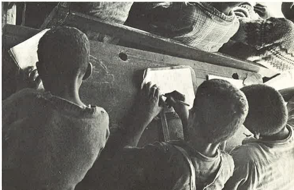
Palestinian boys studying at Baqa'a camp (Amman)

On January 1, 1968, there lived within Israel and the areas under her occupation