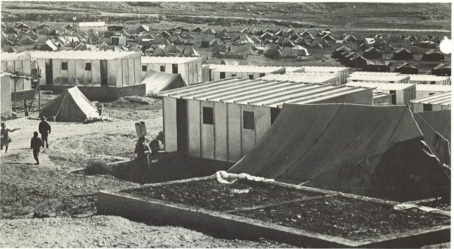
Pre-fabricated cabins replace tents as homes in Souf Emergency camp in Jordan.

In an interview carried on the Columbia Broadcasting System's programme 'Face the Nation' on June 11, 1967, General Moshe Dayan replied as follows to a question as to Israel's ability to absorb the Arab population in the newly occupied areas: