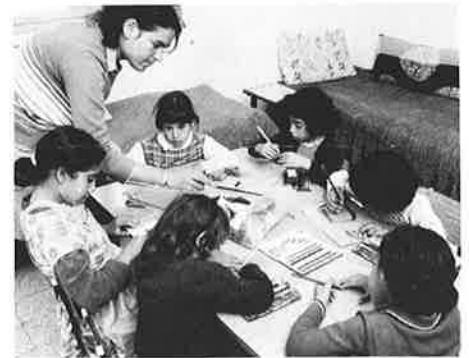
Creative children in the Four Homes of Mercy