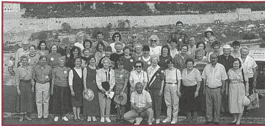
Members of the 1995 Pax World Service tour group in front of the walls of Jerusalem's old city.

Middle East Tours from page 1 meetings are set up with Palestinian and Israeli leaders. It will include opportunities to visit ANERA programs.