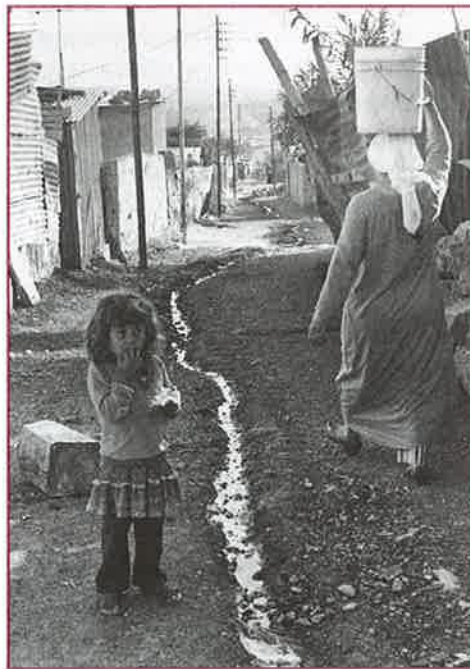
Environmental Issues in the Middle East: an Interview

have risen considerably in public visibility and have captured the government’s attention. This was in part due to the support and financial help that international agencies have provided for both the institutional development of local environmental watchdogs, and for the physical construction of key infrastructural projects.