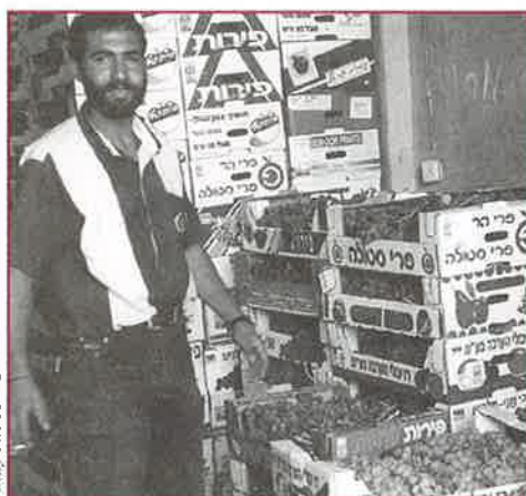
An employee of the Halhoul fresh produce market, a project made possible with ANERA's support, prepares grapes to be sold.

Funding for revolving loan funds for poor farmers in the West Bank and Gaza for farm improvements were disbursed through: the Agricultural Credit Project, Gaza Fisherman's Cooperative, Jericho Agricultural Cooperative, Khan Yunis Agricultural Cooperative, and Rural Women's Credit Program. Animal disease control and agricultural extension activities were funded at the following West Bank and Gaza institutions: Bani Na'im Agricultural Cooperative, Gaza Livestock Cooperative, Hebron Grape Marketing Cooperative, Hebron Livestock Cooperative, Hebron University, Jericho Livestock Cooperative, Khan Yunis Agricultural Cooperative, Nahda Livestock Cooperative, Palestinian Agricultural Relief Committees, Palestinian Ministry of Agriculture — Extension Department.