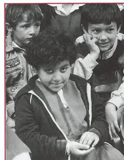
The Palestinian educational system cannot adequately educate Palestinian children, who are half of all Palestinians living in the West Bank and Gaza.