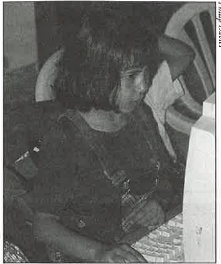
At the Deir El-Balah Rehabilitation Society in Gaza, young children have access to modern learning tools.