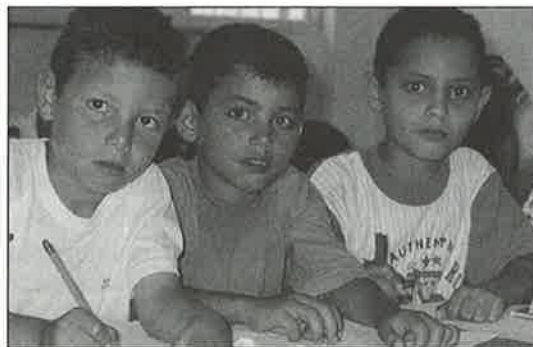
Over 88¢ of every dollar given to ANERA directly serves children, women and men living in the Middle East.

Provision of training and consultants as well as project development, implementation and evaluation. $1,251,333