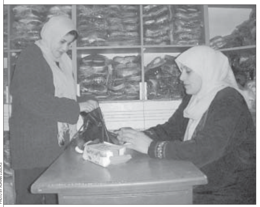
Most GWLF borrowers sell food, clothes, or household items from their homes, a permanent storefront, or a mobile stand.

Roadblocks, curfews, and closure make travel between northern, middle, and southern Gaza difficult and, at times, risky. GWLF staff work out of offices in Gaza City and Khan Younis enabling the program to help borrowers throughout Gaza.