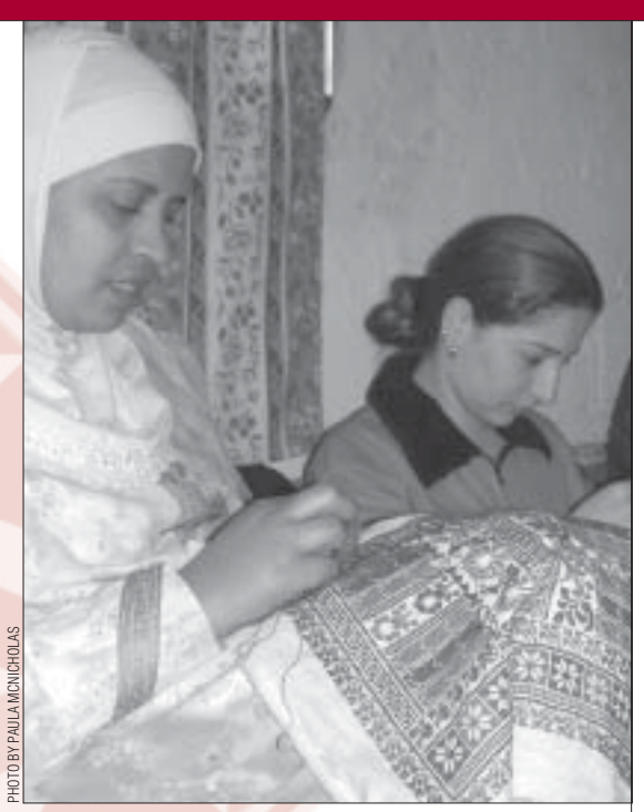
Inaash helps women in refugee camps sell embroidery they make at home. This allows them to take care of their family, while also earning an income.