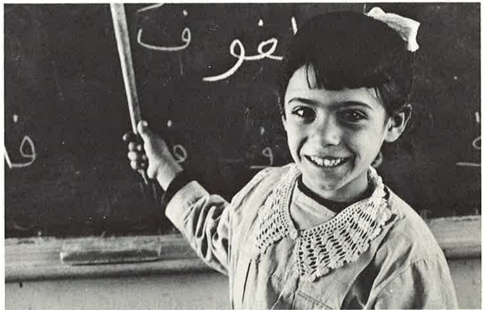
This Palestinian child is studying the Arabic "ABC's". The subject of this lesson the word "el malfouf" ("the cabbage" in English). The photo was taken at the Ein El Tel elementary school near Aleppo, Syrian Arab Republic.

In October, 1974, the current school year will end. At the present time, 101 ANERA donors (including all the members of the ANERA AMER West Coast Medical Subcommittee) and 14 ANERA donors (including Pal-Aid International and the Cambridge Chapter of ANERA) are providing 20 vocational and teacher training scholarships. Those wishing to participate in this program are urged to complete and send a check and the enclosed form to the ANERA office.