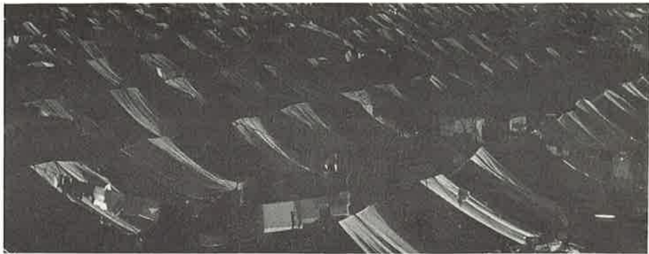
JARAMANA EMERGENCY CAMP, Damascus, Syria —This camp near Damascus provides shelter for some 3,500 homeless Palestinian refugees and it is the largest of the "emergency" camps created after the 1967 Israeli occupation of the Golan Heights in Syria. Until recently, the "homes" of the refugees in Jaramana were these tents. Today, thanks to donations, most of the tents have been replaced by mud-brick huts which offer more protection from the cold winters of Syria.