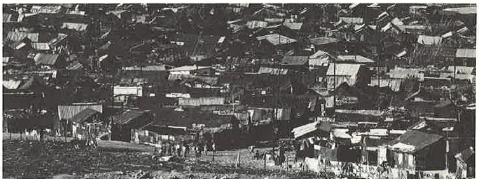
DIKWANEH CAMP, Beirut, Lebanon —On the outskirts of Beirut are the tin shanties of Dikwaneh Camp. Here over 6,000 persons live, most of them in shacks that they have patched together from flattened oil drums, old scraps of lumber and whatever other material they could find.

supplying drugs and interns to civilians during the October War. The Lebanese Red Cross was given $5,000 for similar work in South Lebanon. In Syria, the Syrian Red Crescent Society received $40,000 which has been designated to establish facilities in Quneitra for returning Syrian and Palestinian refugees.