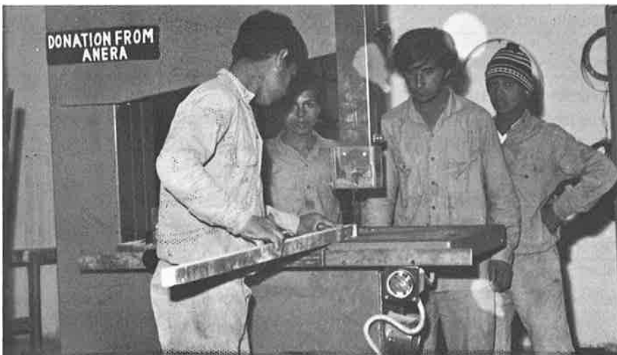
The Al Bir Society was founded in 1952 and provides food, clothing, lodging, medical care, and education and vocational training. The students of the Al Bir Society are orphaned, destitute, and physically handicapped Palestinian young people. As part of their training in carpentry, these boys are learning to use a band saw machine purchased with funds donated by ANERA.