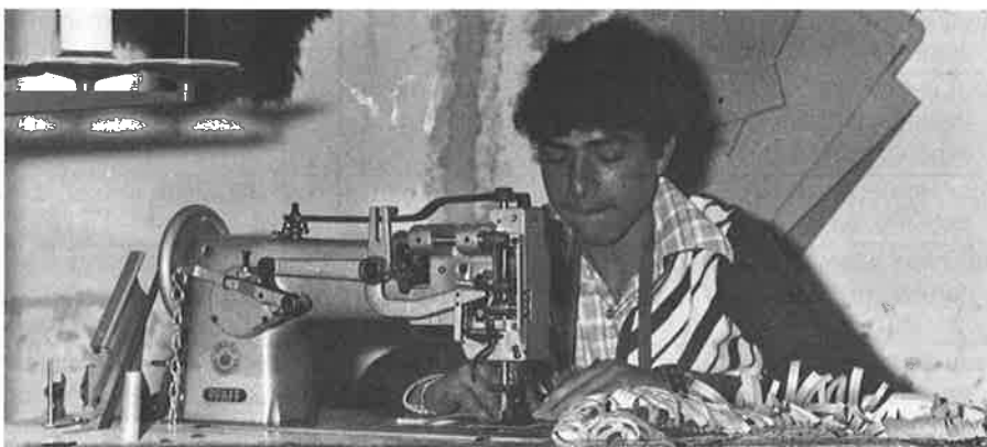
A young refugee learns to work with leather on a sewing machine provided by a donation from ANERA to the East Jerusalem YMCA. The YMCA runs a vocational training center adjacent to Aqabet Jabr Refugee Camp near Jericho on the West Bank. At the center 100 young men are taught carpentry, blacksmithery, upholstery, painting, whitewashing and varnishing, leather work, commercial laundry and ironing, and building maintenance (the principles of electrical installation, central heating, plumbing, and sanitation).

*ANERA is a non-profit, charitable organization which seeks to increase total assistance in cash and kind from American sources to Palestinian refugees and other needy individuals in the Arab World; to be responsive in crises affecting civilian populations in the area, particularly displacement and casualties caused by war; and to increase American understanding of the Palestinian refugee problem.