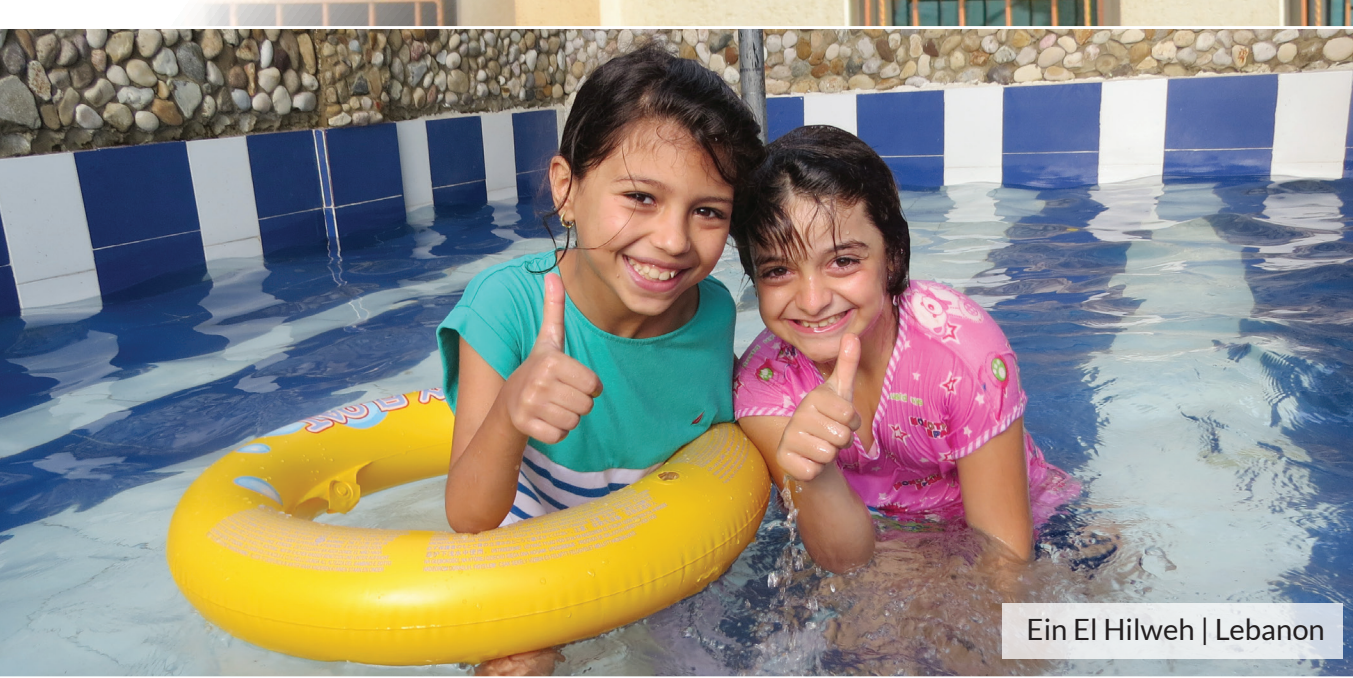
Ein El Hilweh | Lebanon