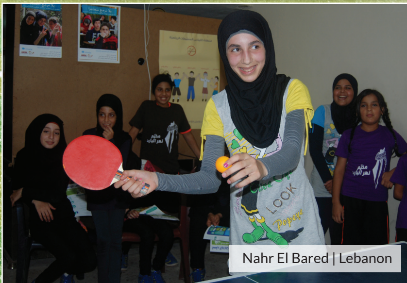
Nahr El Bared | Lebanon