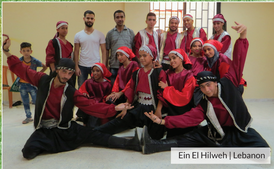
Ein El Hilweh | Lebanon