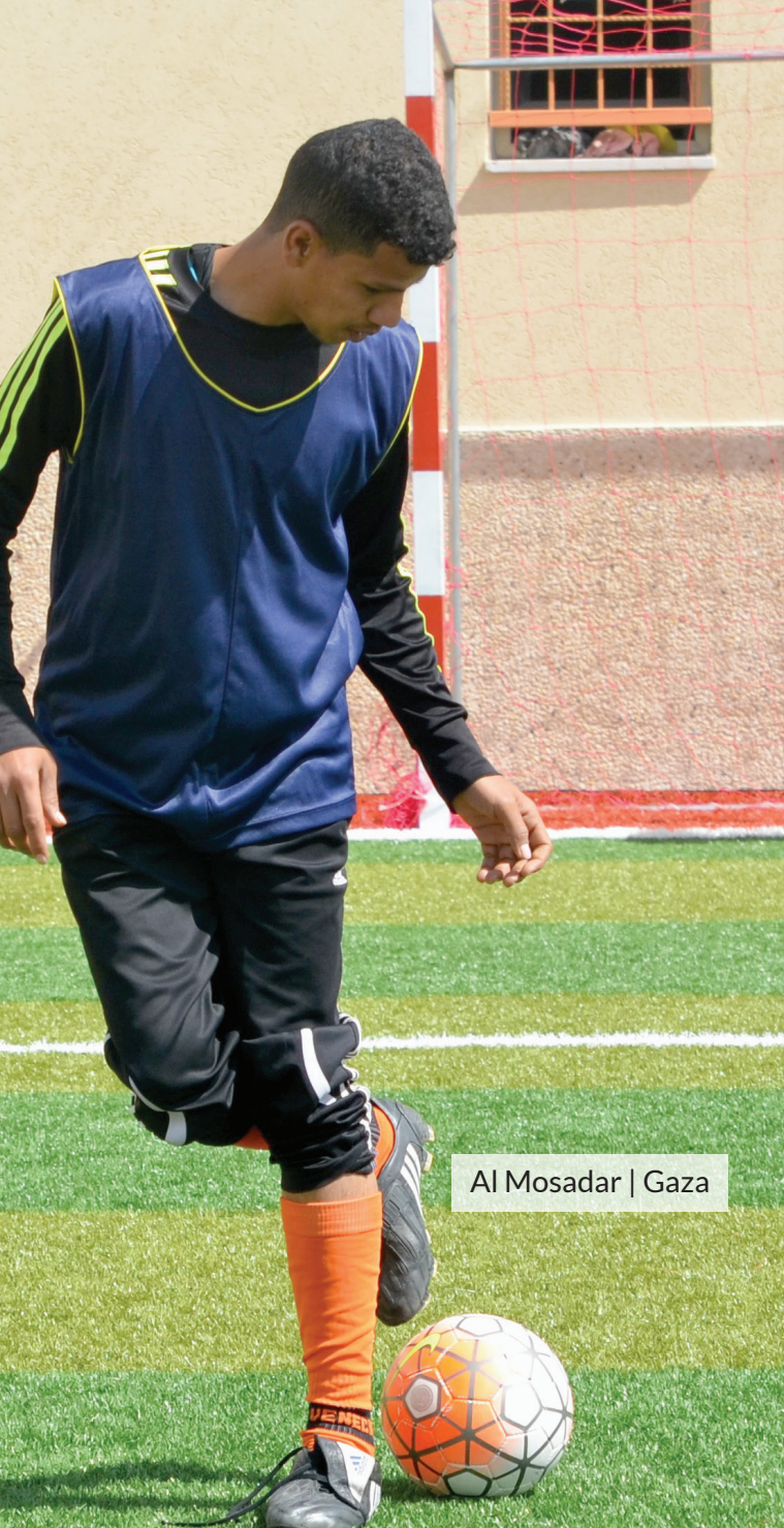
Al Mosadar | Gaza