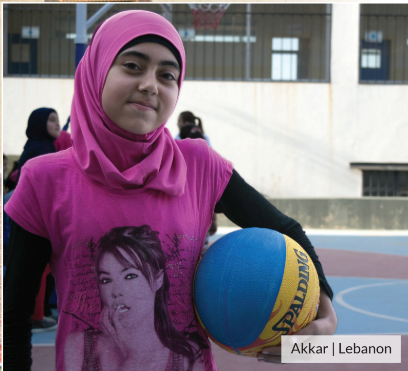
Akkar | Lebanon