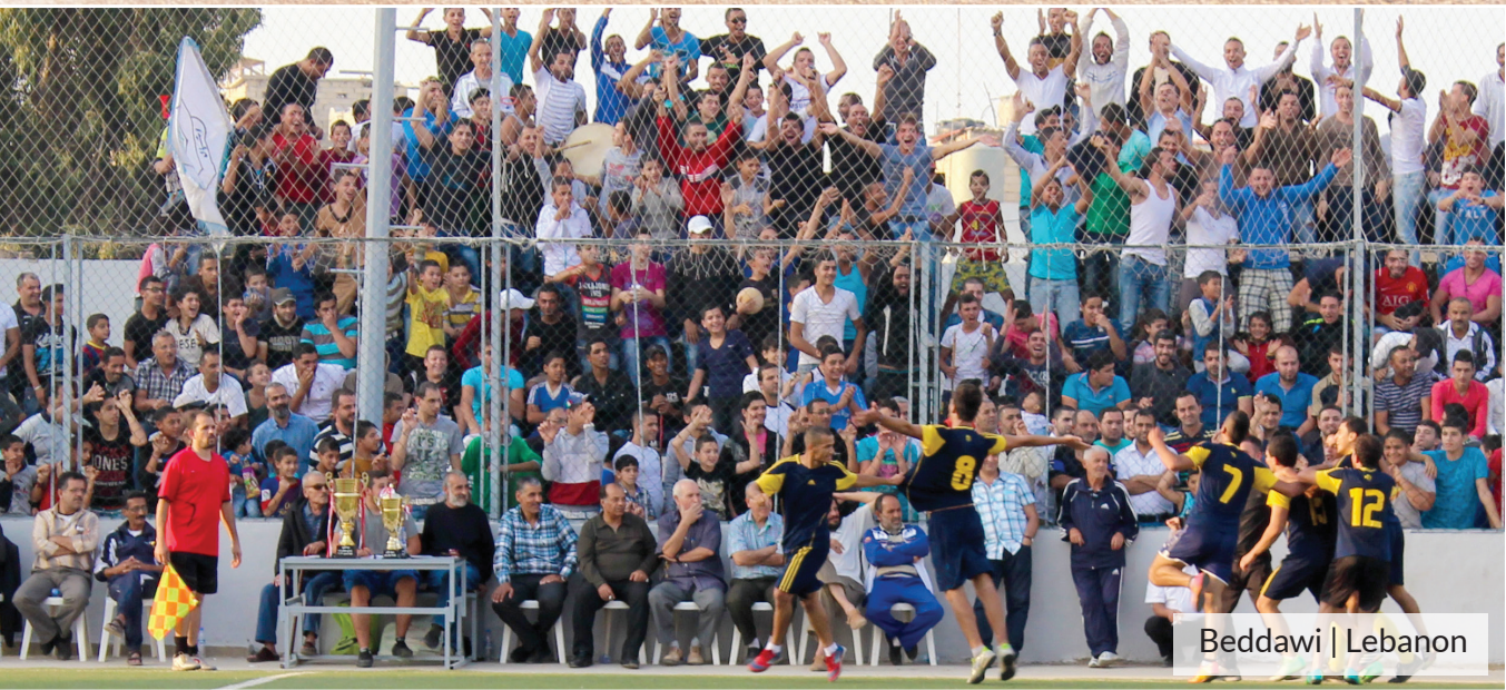
Beddawi | Lebanon