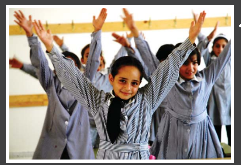
Bardala Girls' School

Rawdat El Zuhur in Jerusalem - One of ANERA's Scholarship Program schools.