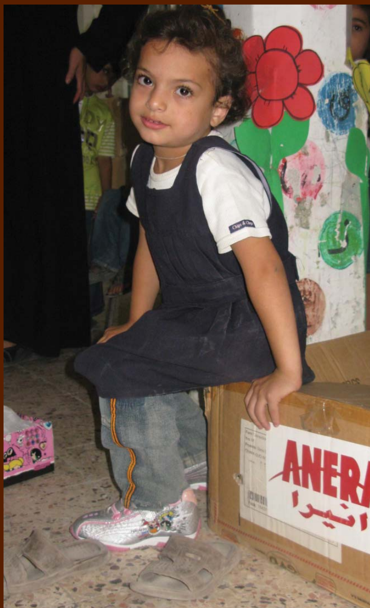
These five-year-olds at the Light of Hope Preschool in the Sha'af area of eastern Gaza are thrilled to be replacing the sandals they were wearing in winter with brand new sneakers.

If you have an online fundraising idea, please share it with us. Send an e-mail to donate@anera.org .