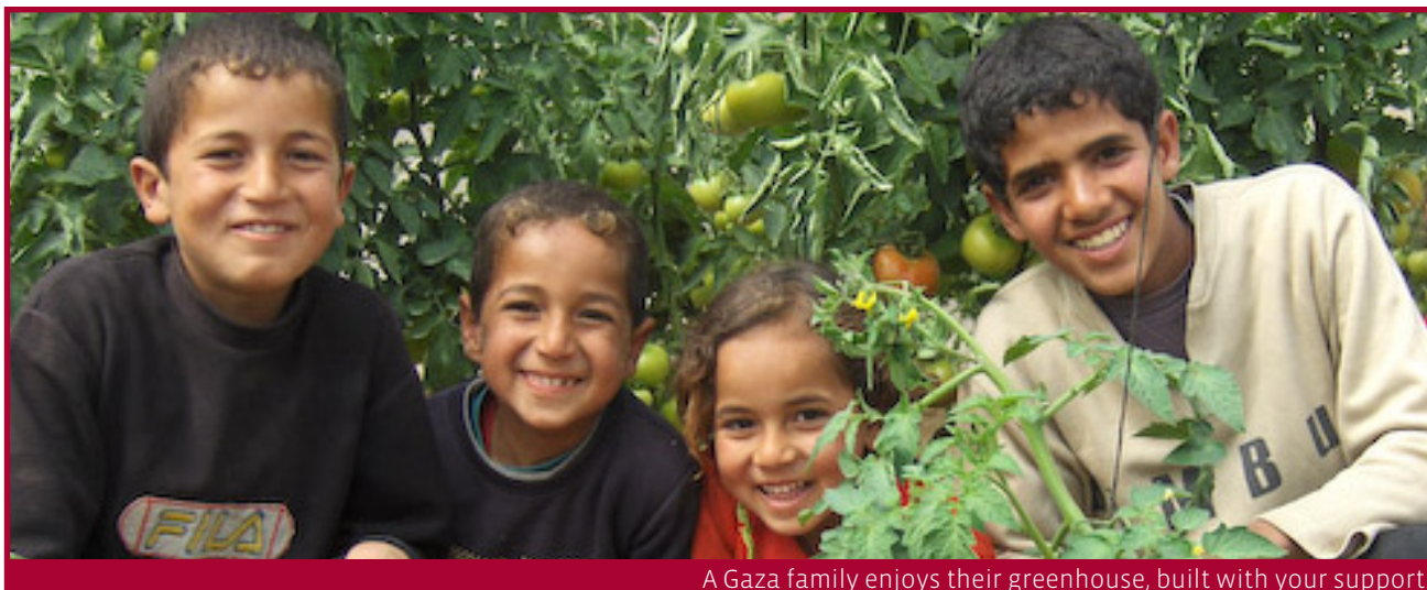
A Gaza family enjoys their greenhouse, built with your support.

...the end of the year is around the corner.