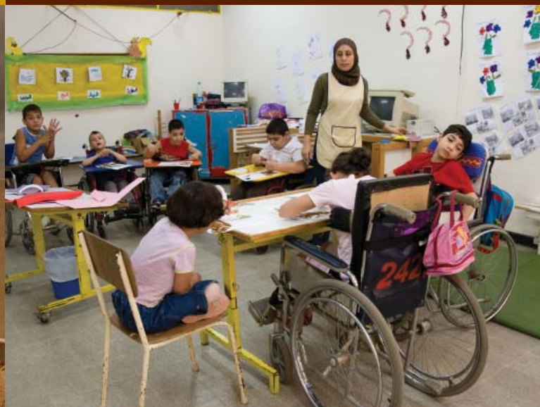
Supported the education of hundreds of children with special needs