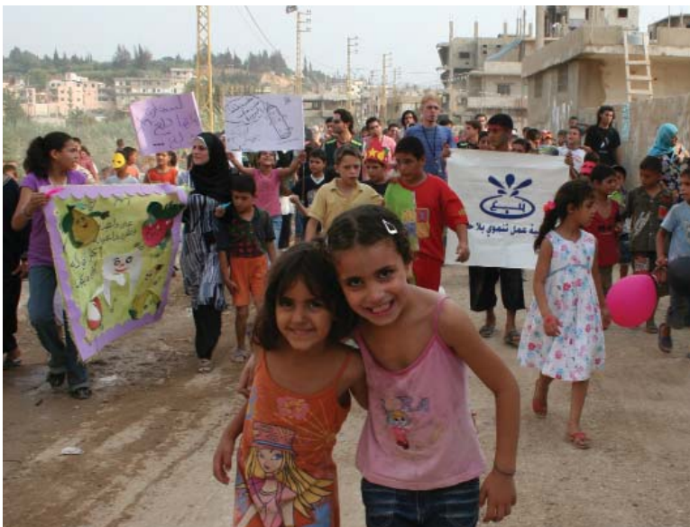
Educated more than 4,000 children in Lebanon on living healthily