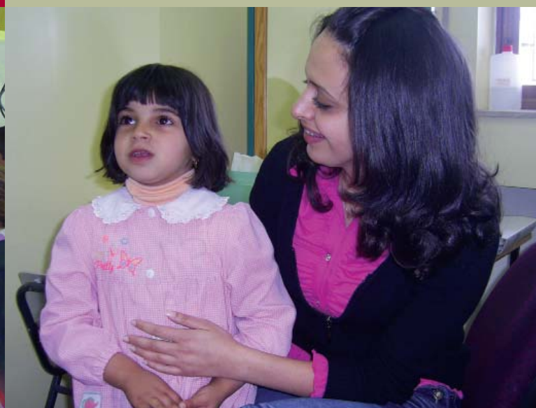
Began supporting a school for deaf children in Bethlehem