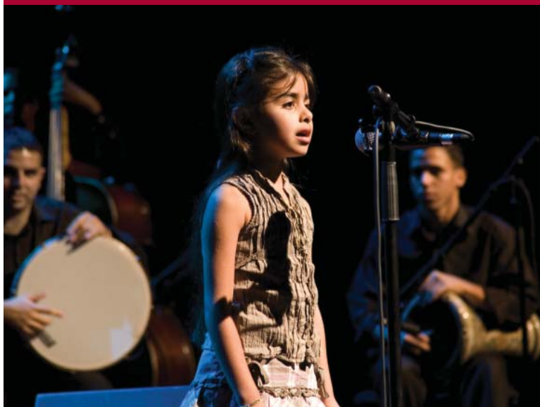
Supported music education in the West Bank and Gaza