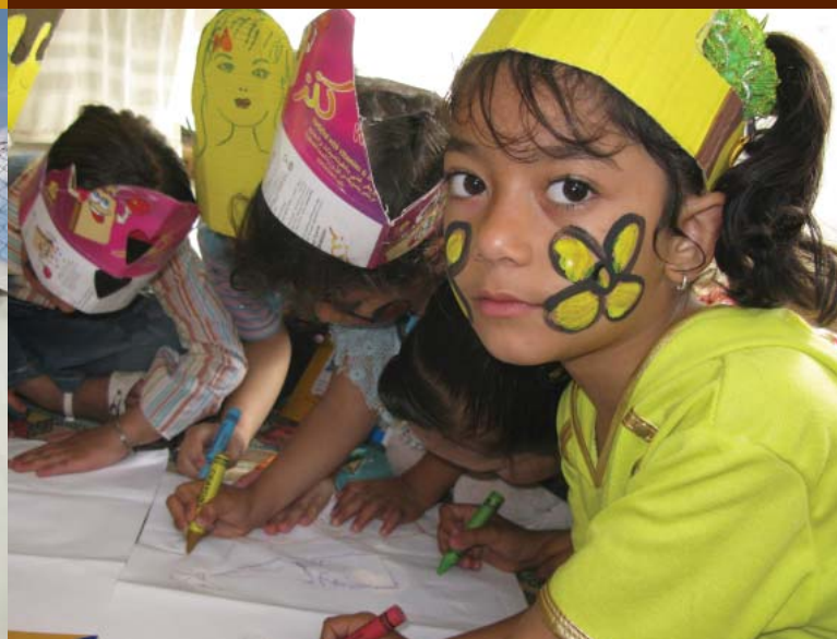
Delivered nutritious milk and biscuits to 25,200 Gaza preschools