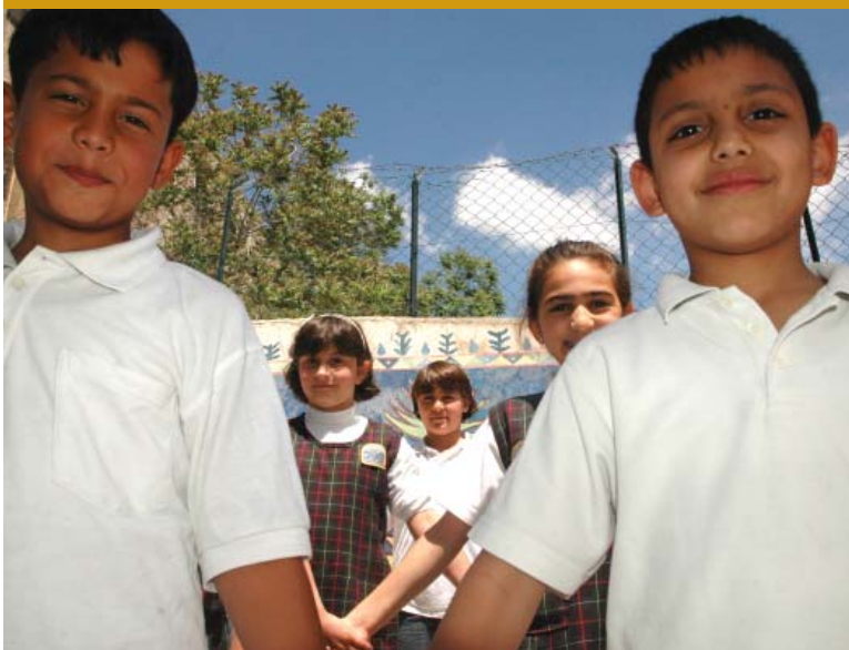
Celebrated the 30-year anniversary of the Scholarship Program