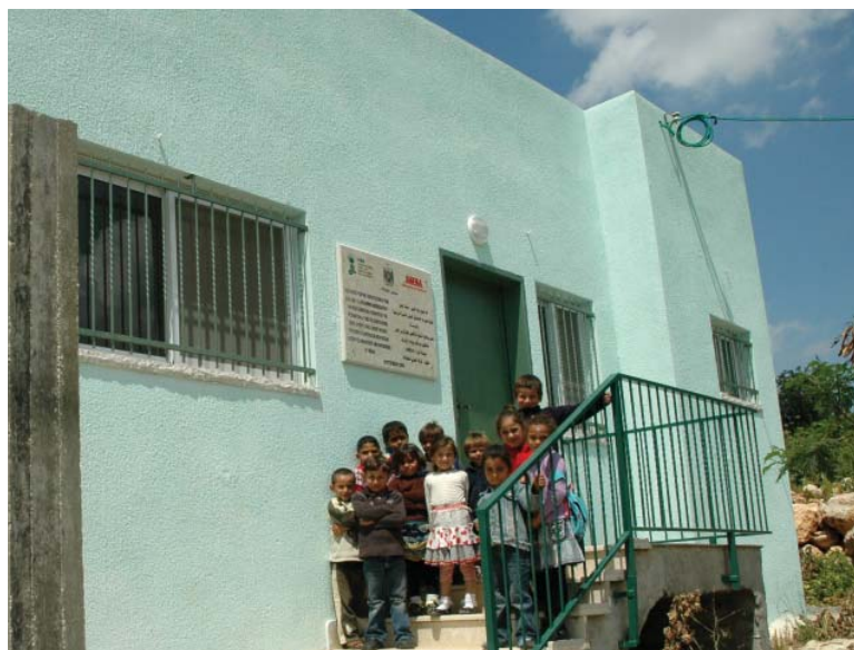
Built a new kindergarten in Almdawar, a West Bank farming village

Education work in academic year 2008-2009