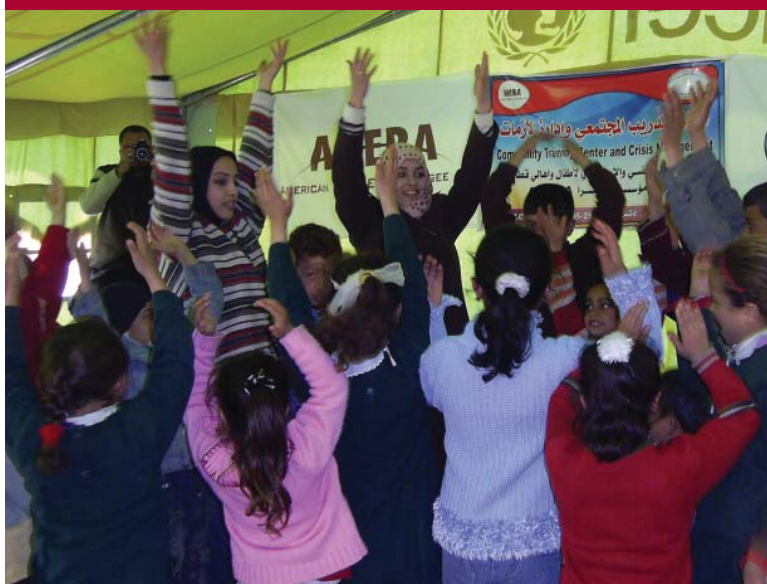
Provided psychosocial assistance to 6,500 children in Gaza