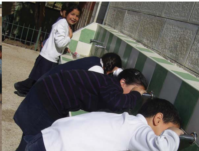
Upgraded the water systems in 11 West Bank schools