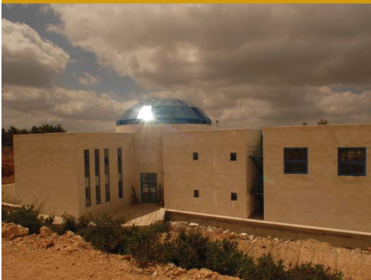
Finished 1 st year of the 4 th I.T. Center of Excellence in the West Bank