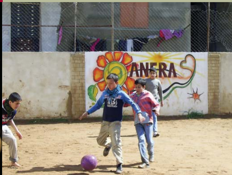
Installed a soccer field in Nahr el Bared Refugee Camp, Lebanon