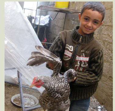
The chickens lay an average of 8 eggs a day, adding up to some 200 a month. They are a great source of nutrition for families.