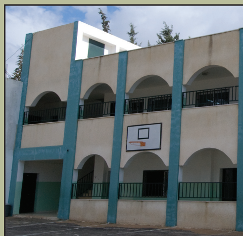
Rafat: At Rafat Secondary School, ANERA added a second floor with classrooms, a laboratory and office, plus toilets, and a protecting balcony.