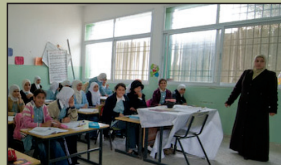
Zawiya: At Zawiya Secondary Girls School, ANERA added a building with six classrooms.