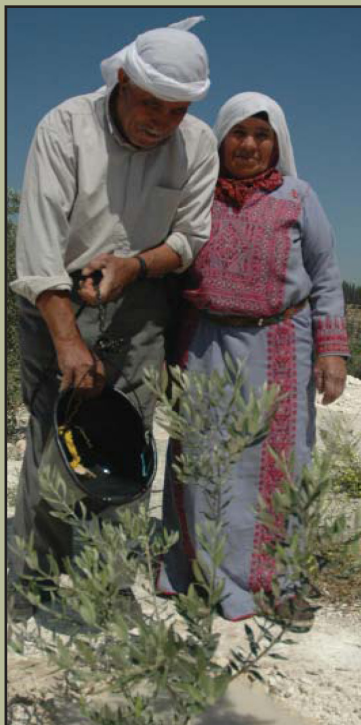
Al Midya: ANERA installed two cisterns, supplying water to the village's five acres of olive and fig trees.

“These two cisterns are a blessing. We have around one hundred sheep that graze here. Yesterday, I drew some cistern water for them to drink.”