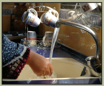
Ras al Tira and Ad Dab'a: ANERA installed water networks, providing a sustainable source of clean water to the residents of two villages.