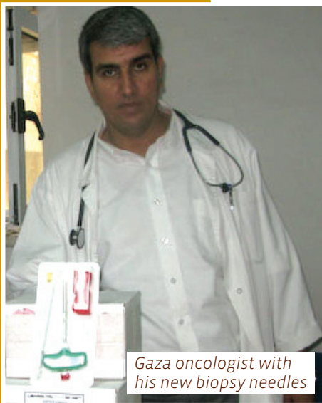
Gaza oncologist with his new biopsy needles

Arab Community Center for Economic and Social Services AmeriCares Catholic Medical Mission Board Direct Relief International Genzyme Grassroots International Hope Haven International Industries International Orthodox Christian Charities Latter-day Saints Charities Medical Teams International MAP International Mennonite Central Committee National Arab American Medical Association Palestine Children's Relief Fund Physicians for Peace Wheelchairs for Humanity