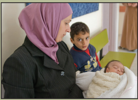
Dayr Balut: Built a center housing a health clinic and preschool for the community.

“We were all delighted with the construction of this road. It takes me less time and effort to reach my land now, by foot or car.”