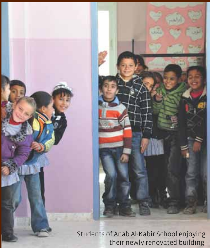
Students of Anab Al-Kabir School enjoying their newly renovated building.