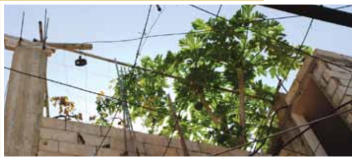
Green is competing with the criss-cross of wires that hang overhead in every refugee camp.