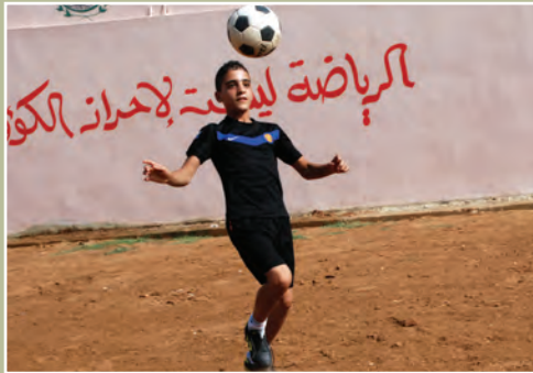
ANERA rehabilitated a football field that is the only one available without charge for the camp's 18 sports clubs with their 1,500 members.