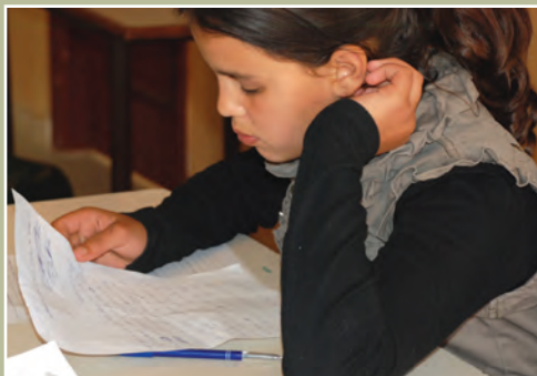
ANERA provides learning support and remedial education for hundreds of young students who need a little help to do better in subjects like math.