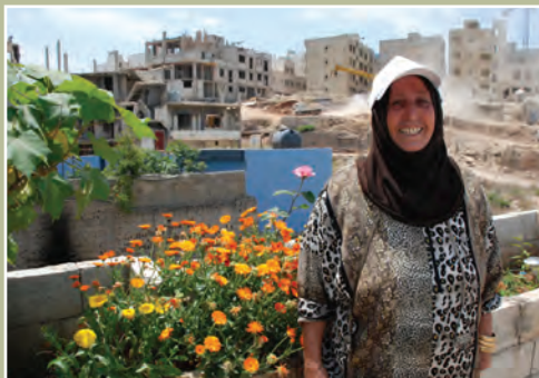
More than 100 home gardens have been planted with thousands of fruit trees and plants – both a source of food and pride for families.