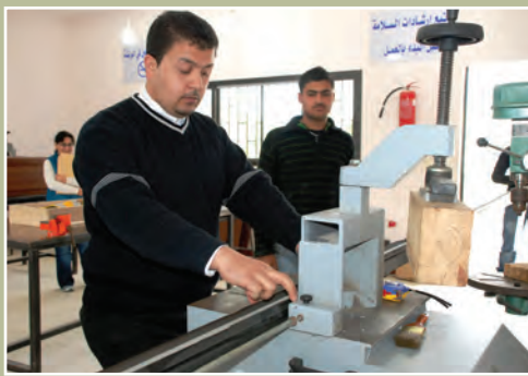
ANERA actively supports vocational training in the building trades, graphic design, hairdressing, nursing, and other marketable job skills.