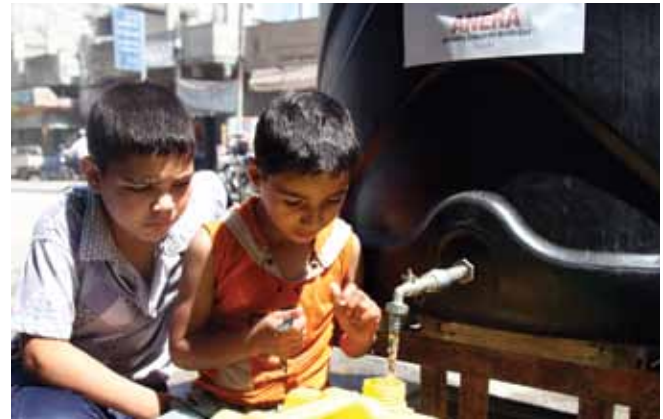
Children in Khan Younis fill up a water jug at one of the 87 water tanks ANERA set up and refills daily throughout Gaza.