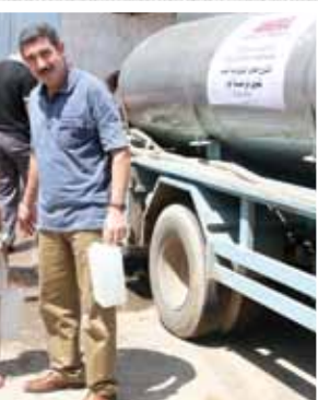
ANERA Gaza Director

ANERA's Gaza office is made up of seasoned education, health and development professionals. For 51 days in July and August, they – like everyone else in Gaza – feared for their lives as bombs rained down on their tiny strip of land. No one felt safe. And yet, despite the bombs and the fear, ANERA's staff set aside their usual duties and responded to the crisis in whatever way they could be most useful. They took on a variety of emergency relief roles because they wanted to help the neediest in the devastated communities around them.