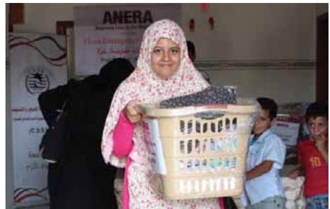
ANERA distributed hygiene kits to 36,577 displaced families.