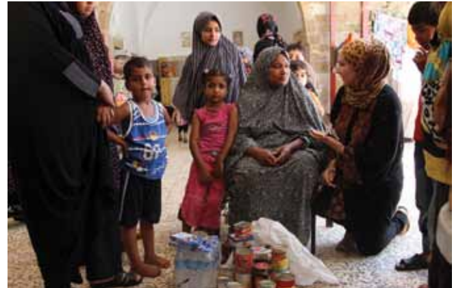
ANERA locally purchased and delivered 5,079 food parcels to families throughout Gaza.