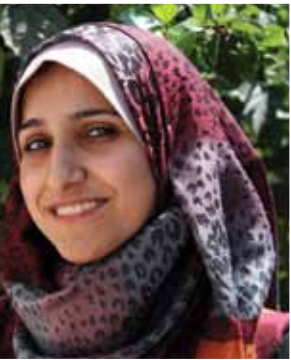
Intern, Development Program