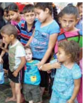
Project Engineer, Development Program

Now that things are quiet again, the full scope of what needs to be done becomes clearer every day. ANERA's staff is continues to distribut relief items like water, food, hygiene kits and more. But they have also resumed their professional roles, doing damage assessments, making repairs with what's available inside Gaza and planning for the future.