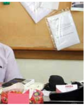
Structure Coordinator, PCID