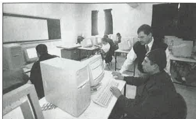
Al-Quds University is working with ANERA to create skilled professionals and to fill available jobs in information technology.

Status: ANERA is talking with various donors about supporting this component of the program.