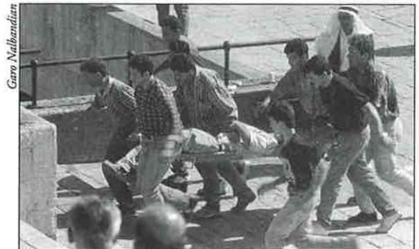
The continuing violence that began in 2000 is causing enormous strain on the Palestinian health care system.