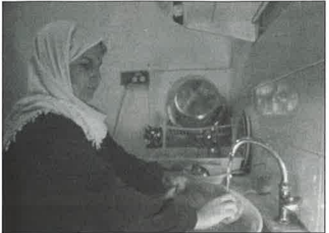
Improving the health and viability of communities, ANERA continues to implement projects that provide clean, drinkable water to poor families.