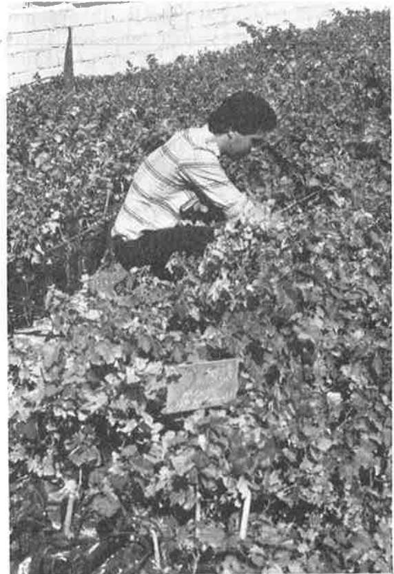
West Bank nurseries experiment with new grape seedlings for farmers considering vine substitution.

With these measures, the grape growers of the Bethlehem and Hebron districts hope to avoid the fate of Ramallah's growers. While averting certain catastrophe, these efforts will also go a long way in addressing the second problem facing growers: deteriorating prices and markets for grapes.