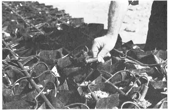
This irrigation system waters individual plants at the rate of a dripping faucet. These networks eliminate the watering of surrounding soil and weeds.

Phylloxera is already stimulating the demand for disease resistant seedlings and revolving loan funds to finance their