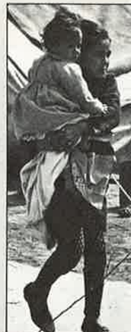
Crisis in Lebanon