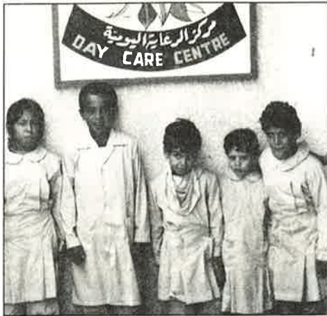
Students at the Society's main building