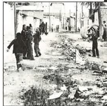
Left: Children playing near exposed sewage.

mothers learn to better understand, educate and care for their handicapped or traumatized children. The only requirement for participation in this program is the families' desire to improve their children's lives.