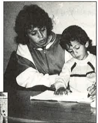
Above: A mother and son participate in the Home Care/Early Intervention Program.

The Early Intervention Outreach Program trains teachers to meet with mothers and their children at home on a weekly basis. They give lessons using an established curriculum, emphasizing cognitive and language development, motor skills, and socialization. By working alongside the teachers,