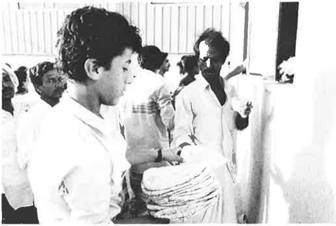
ANERA funds helped Jordanian relief agencies provide food and shelter to Asian refugees, as they waited in desert transit camps to return to their homelands.