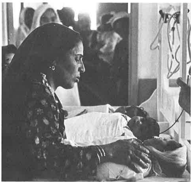
Through AMER, ANERA assisted UNRWA mother/child health care clinics in the Gaza Strip with donated medical supplies and pharmaceuticals.