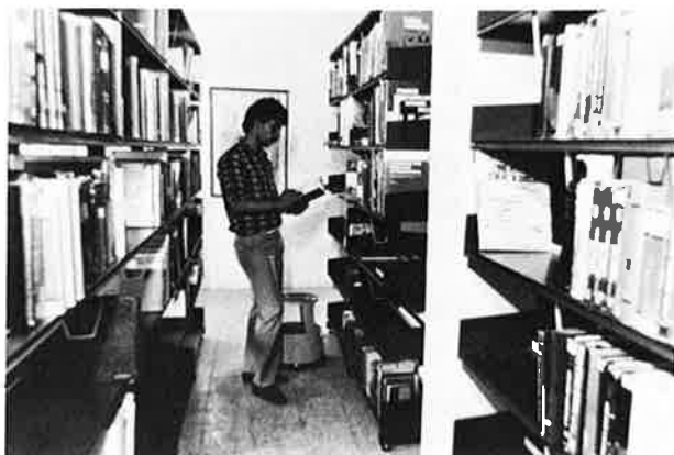
ANERA helps colleges, technical schools and communities build their libraries.