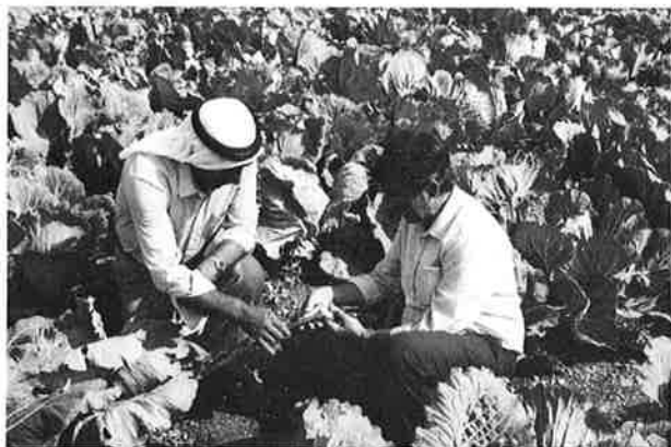
People helping people through ANERA projects