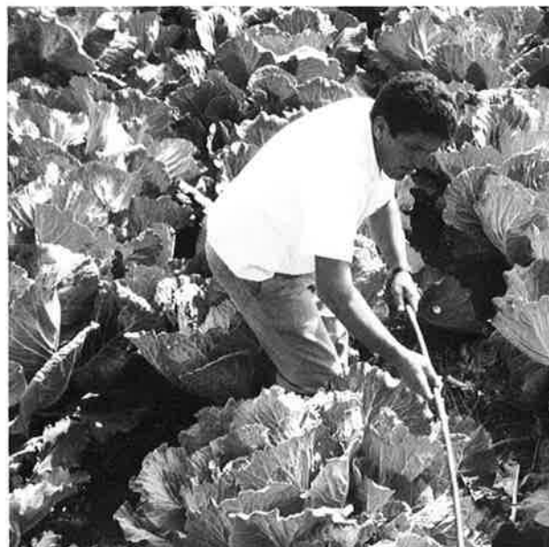
A farmer demonstrates modern drip irrigation techniques used by his cooperative.