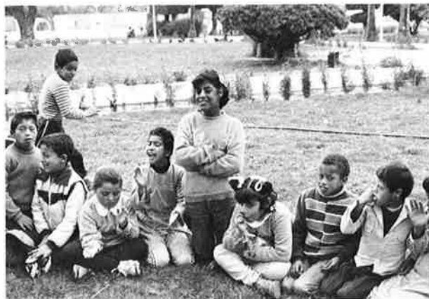
Gaza children at the Society for the Care of Handicapped Children.