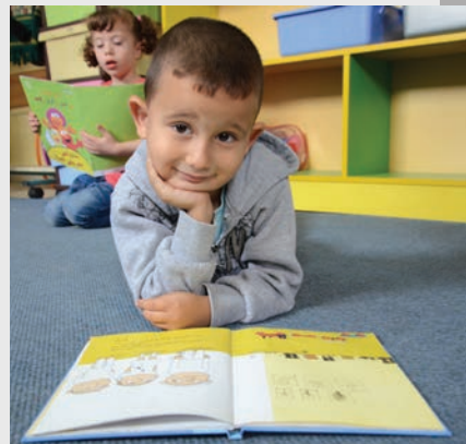
Children read their new books at the Isra Preschool in the Qalandia Refugee Camp.