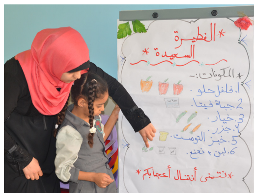
A teacher uses recipes to teach the children in her Gaza preschool about healthy eating.