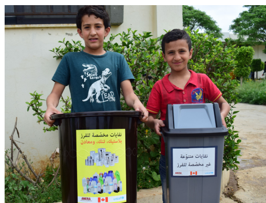
Brothers picking up their family's recycling bins in northern Lebanon.