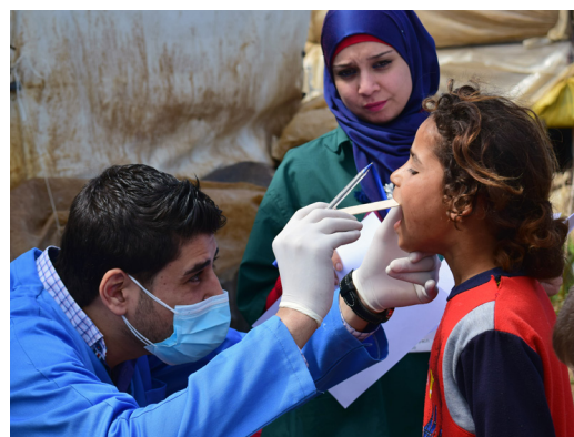
Dentist visits a tented Syrian refugee camp in Lebanon, checking to see if treatment is necessary.

Water, Sanitation and Hygiene | In Gaza, lack of water and sanitation facilities mean that families cannot bathe, wash their hands, and clean their houses. Anera has installed water and sanitation networks in communities and distributed hygiene kits to families. Health awareness sessions help mothers identify parasitic infections in their children.