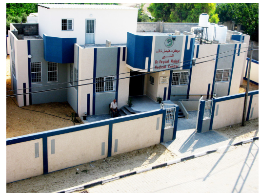
The Beit Lahia Health Clinic in Beit Lahia, Gaza. Built by Anera in 2018.