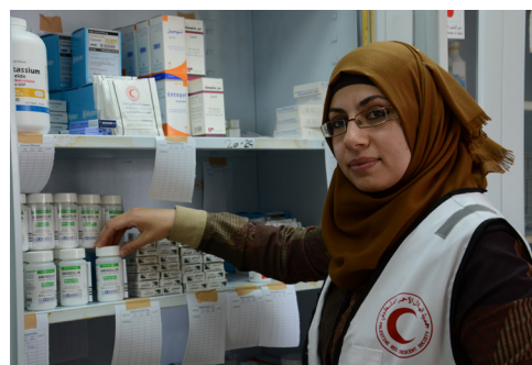
A pharmacist shelves new medicines Anera delivered to her West Bank clinic.

Emergency Response | In emergency situations , Anera has the ability to act quickly to address the most pressing needs. In Lebanon, we help ease the burden for thousands of Palestinian refugees fleeing Syria's conflict as well as for the families who have opened their homes to shelter them. The winters in Lebanon's Bekaa Valley and northern regions can be cold, wet and snowy. With funding from donors like UMCOR, UNOCHA and Zakat, Anera provides thousands of blankets, lamps, food and hygiene kits to keep families warm and healthy through the cold season. Following the Gaza bombing in the summer of 2014, Anera invested $13 million in relief and development, employing funds from a multitude of organizations to give Gaza families access to water, hygiene items, medicines, food and clothing.