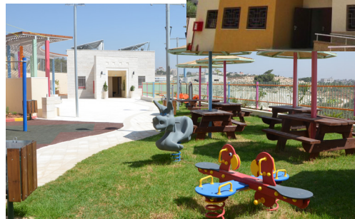
Above: Community Center in Khan Younis, Gaza.

Parks | We turn vacant, rubble-filled lots into vibrant, landscaped parks where children can safely explore. And, in just the past seven years, Anera has built 12 parks in Gaza and the West Bank, helping to foster community bonding, emotional well-being, and to provide needed outdoor spaces for children to play and families to gather.