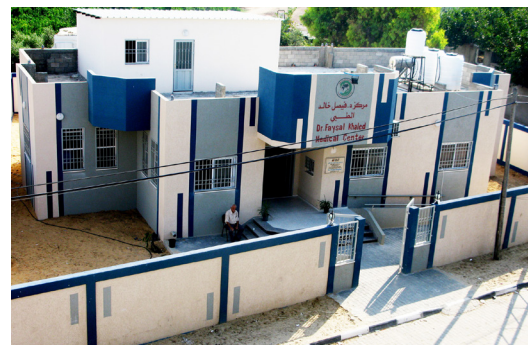
Anera built the Faysal Khaled Health Clinic in Beit Lahia, Gaza in 2018.