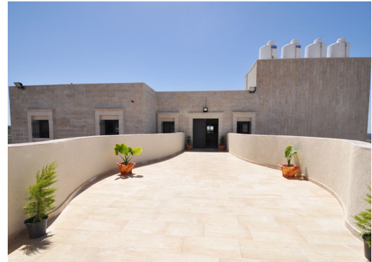
Anera constructed this health clinic in the village of Al-Walajeh, which lies within Area C of the West Bank. It provides health services to 2,500 people.

Building Schools | Anera has been improving schools and educational facilities in Palestine and beyond for decades. From preschools to universities, Anera steps in where we're needed to ensure young people have safe spaces to learn and grow, with the tools they need to succeed. We build new schools and add classrooms onto existing ones. We install sanitation systems that make bathrooms clean and water safe to drink. Our science labs come equipped with microscopes and beakers and our libraries are filled with books and computers. In just the past few years, Anera has renovated or built 54 schools of different levels, preschool through secondary, across Palestine.