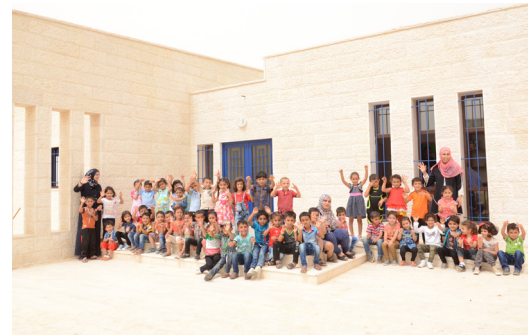
Al-Majd Preschool includes colorful classrooms, safe play areas, and modern amenities.

Preschools | Since 2010, Anera has upgraded and equipped 165 Palestinian preschools, as part of our early childhood development program. Our work is based on a long-term, holistic, and sustainable model that combines physical infrastructure improvements in schools with comprehensive professional development trainings for teachers. Anera is currently building seven new preschools in the West Bank. Our education experts take every detail into consideration, from providing kid-friendly furniture to making sure facilities are welcoming and accessible for all.