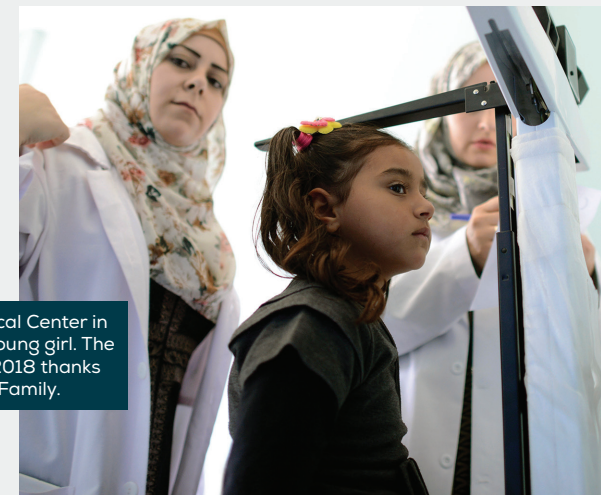
A nurse at the Dr. Faysal Khaled Medical Center in Gaza provides a free check-up for a young girl. The medical center was built by Anera in 2018 thanks to generous funding from The Khaled Family.

American Institutes for Research Embassy of the Hashemite Kingdom of Jordan Embassy of Turkey General Delegation of the PLO to the U.S. Gifts That Give Hope Helping Hand for Relief and Development Islamic Cultural Center of Greater Chicago Mental Health Services Fund at the Charlottesville Area Community Foundation Paypal Giving Fund St. John's Episcopal Church St. Mary's Orthodox Church Upper Cape Alternative Gift Market