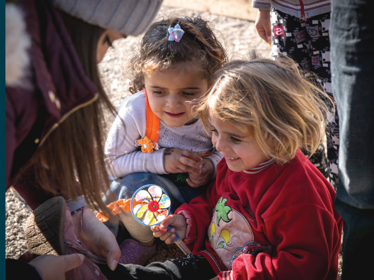
Anera donors helped provide winter boots for these Syrian refugee children in Bekaa, Lebanon.