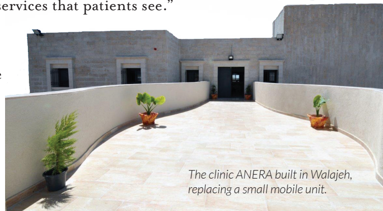
The clinic ANERA built in Walajeh, replacing a small mobile unit.

"What fuels my motivation and gives me a great sense of fulfillment is that I truly believe I am of service to my community. Whenever the political situation deteriorates and Palestinians are injured, I am there to help."