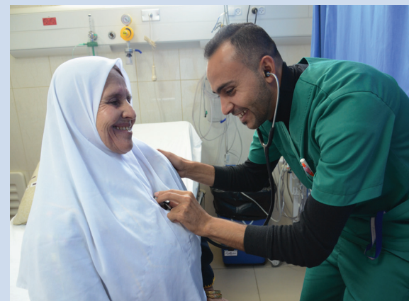
Doctor and patient at the Halhoul Clinic.