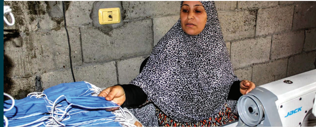
Anera is employing women in Beit Hanoun, Gaza to produce face masks for their communities.

We also pivoted long-term development programming towards humanitarian response. Youth in our non-formal education program in Lebanon gained experience and income, as carpentry students construct COVID-19 isolation centers, plumbing and electrician students build disinfection gates, and catering students make meals for the elderly and infirm. To date, our sewing students have made 1.6 million face masks. Our Lebanon team recently shared their mask-making techniques with a women's cooperative in Beit Hanoun, Gaza (our partner featured in the last newsletter). Members of the cooperative are now making thousands of masks for communities across Gaza.