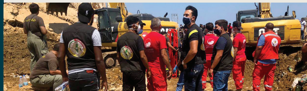
Anera construction students from Shatila Palestinian refugee camp, cleaning up rubble at the port.

Despite the shock our own staff in Lebanon suffered, the team moved quickly to respond in the immediate aftermath of the Beirut blast. They mobilized volunteers to clean streets and distribute food, PPE and cleaning supplies to hundreds of families who were picking up the pieces. Now, they are working quickly to rehabilitate 2,000 homes before cold weather sets in.