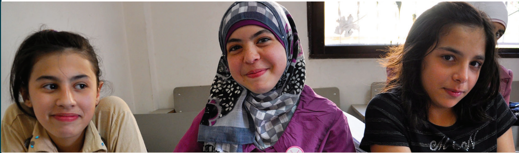
Education is core to breaking the cycle of poverty for refugees in Jordan.

navigate the importation and distribution processes after our absence. The shipments, valued at $18,000 and $12,000 respectively, included chronic medicines and vitamin D droplets distributed to two of Anera’s excellent in-country partners, Jordanian Medical Aid for Palestinians (JMAP) and Syrian American Medical Society, which were previously forced to reduce or halt their operations due to COVID-19.