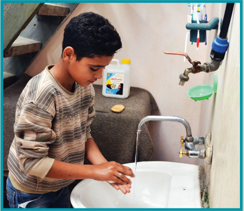
Suqia Jenin water well A young boy uses his family's newly connected tap.