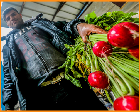
Water well in Jabalia A merchant with his freshly washed Spanish radishes in front of the Anera-renovated water well pump facility in Jabalia refugee camp, Gaza.