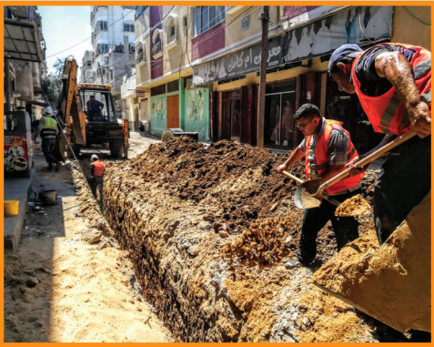
Wastewater network in Zeitoun Workers dig deep trenches in the street in order to lay the new sewage lines.