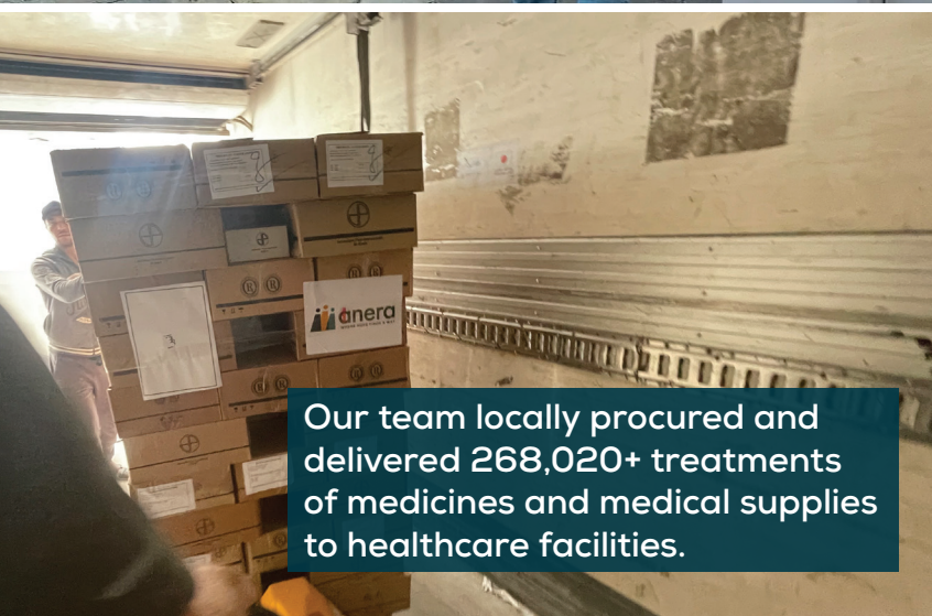
Our team locally procured and delivered 268,020+ treatments of medicines and medical supplies to healthcare facilities.