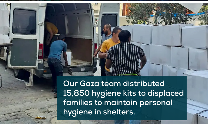
Our Gaza team distributed 15,850 hygiene kits to displaced families to maintain personal hygiene in shelters.