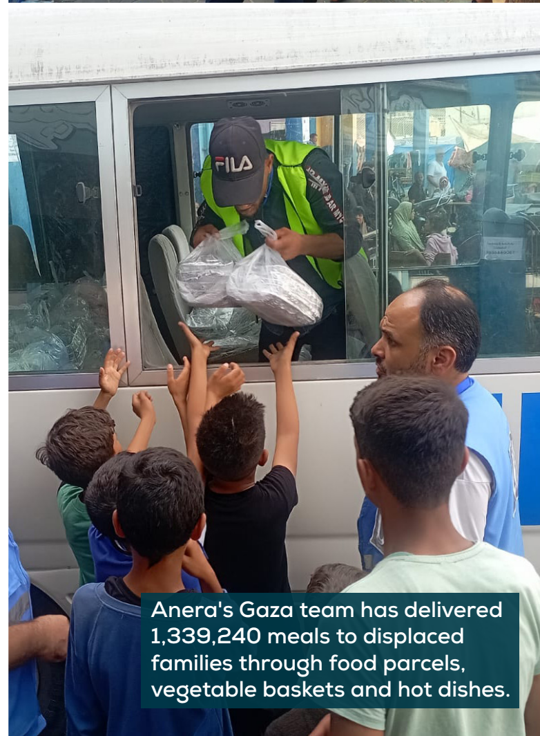
Anera's Gaza team has delivered 1,339,240 meals to displaced families through food parcels, vegetable baskets and hot dishes.