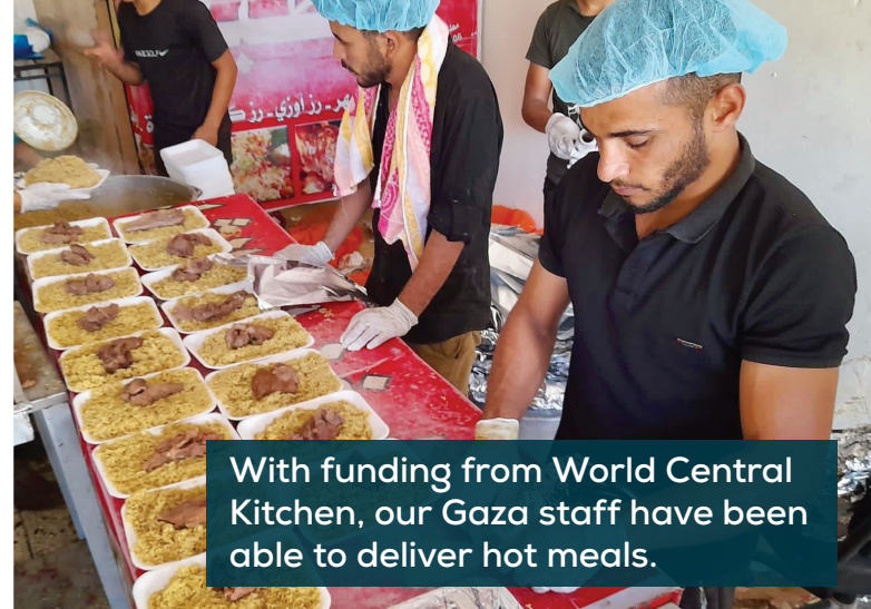
With funding from World Central Kitchen, our Gaza staff have been able to deliver hot meals.