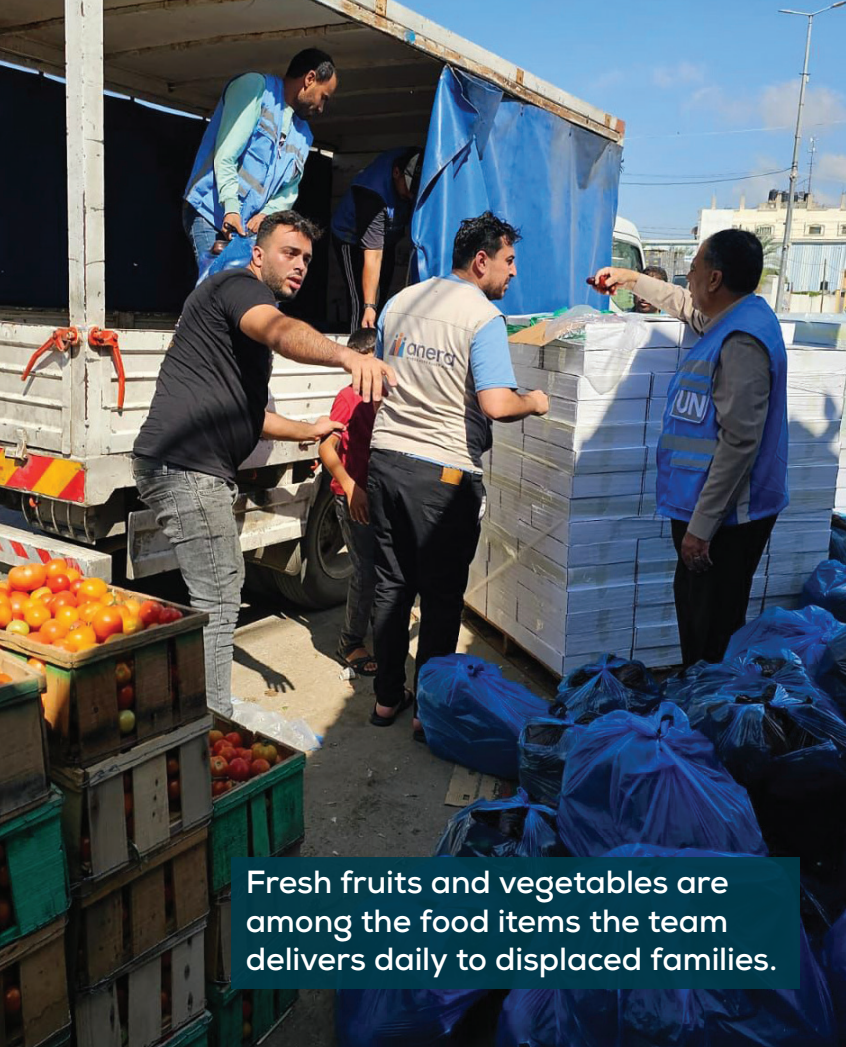
Fresh fruits and vegetables are among the food items the team delivers daily to displaced families.