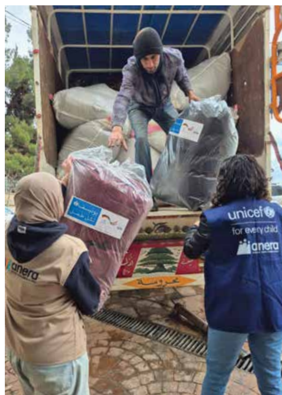
Unloading bedding from UNICEF, with funding from the German government, for displaced families in Lebanon.